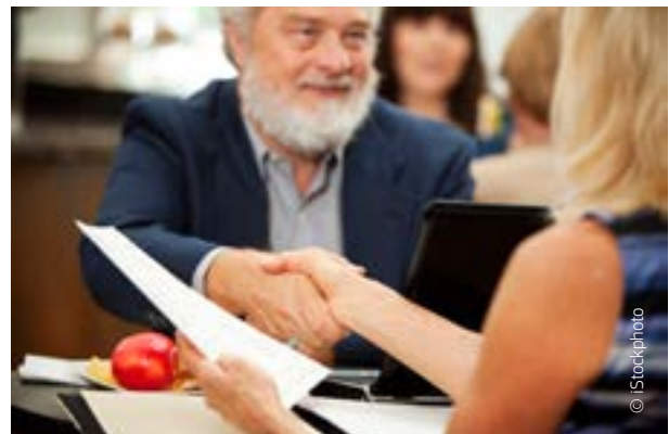
The demographic challenge: "People seem to have a blind spot in this respect".

It will surely lay the foundations for a debate which, hopefully, will unfold during the next European Parliament elections, in 2014. The reform of the European social models is going to be a long term process. I hope that this Package will give the debate a positive turn: Europe has been in the lead in developing social welfare systems based on labour. We should be proud of what was created at the time to eliminate child labour, poverty, indecent work... Today, the models need to be refined. They have to be sustainable and adequate for a new context, adapted to new risks and to lasting crisis situations. We should be proud of taking the lead in this area. Many countries and people will be interested to see how Europe goes about it. It's a fascinating challenge.