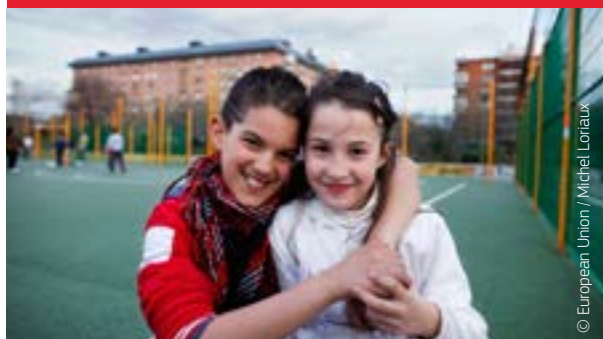
High potential: The Roma represent a growing share of the EU working age population.

And yet, Roma integration holds out considerable economic benefits. The Roma represent a growing share of the working age population, with an average age of 25 compared to the EU average of 40. According to a recent research by the World Bank, full Roma integration in the labour market could bring economic benefits estimated to amount to around €0.5 billion annually for some countries.