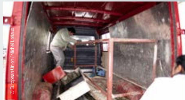
Inclusive microcredit: a pilot social microcredit programme helps Roma people become self-employed.

Commissioner László Andor, European Commissioner for Employment, Social Affairs and Inclusion, spoke on 4 September, in Brussels, at the closing conference of the Kiútprogram "A Way Out - and a Possible Way Forward: Social Microcredit, Financial Inclusion and Self-Employment", an event organised jointly with the World Bank and the Polgár Foundation. The aim of the conference was to present the pilot Kiútprogram and its social microcredit model which seeks to help Roma people to become self-employed. The Commissioner acknowledged the Kiútprogram's achievements as inspiration for the next European Social Fund programming period. He underlined the social profit goal of the programme, and presented the concept of inclusive microcredit. Commissioner László Andor also stressed the importance of an integrated approach for Roma inclusion, which requires coordination