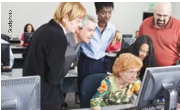
In England: a Digital Activists Inclusion Network.

Despite numerous campaigns, projects and initiatives, there are still 8.2 million people in the United Kingdom who have never been online. People without basic digital skills and access to the Internet are barred from a multitude of information and services. As a result, they often face difficulties in finding solutions to their social, cultural, education, health or labour market related problems.