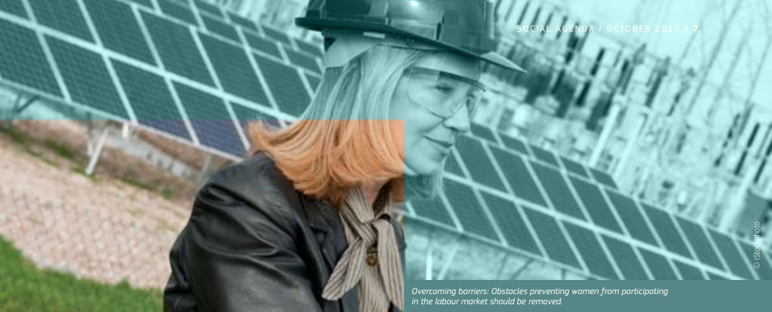
Overcoming barriers: Obstacles preventing women from participating in the labour market should be removed.