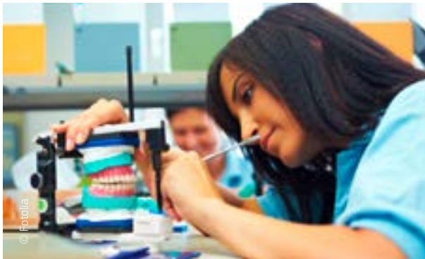
In companies too: Boosting the number of company placements for cross-border traineeships.

“Within a few months of leaving school, young people should receive a good quality offer of employment, continued education, apprenticeship or traineeship”, the Presidents and Prime Ministers of the EU Member States (the European Council) declared in January 2012. They then proceeded to endorse the Youth Opportunities Initiative, which the European Commission had put forward the previous month (see Social Agenda n°30).