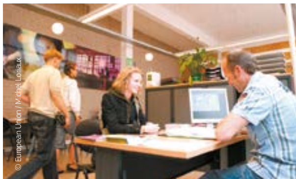
Jobs for Europe: Europe, and people, cannot afford to wait for financial markets to stabilise.

Bringing jobs to the forefront of the EU's political agenda was the focus of the Employment Policy Conference “Jobs for Europe” on 6-7 September in Brussels. Hosted by Commissioner László Andor, the conference was the European Commission's key event of 2012 in building up a strong employment policy agenda and developing a jobs-centred approach towards exiting from the economic crisis. It highlighted the importance of employment policies and of investment in people for implementing the Compact for Growth and Jobs and delivering on Europe 2020 targets. Building on the Commission's Employment Package of April 2012 and responding to the renewed increase in EU unemployment, the conference showed ways forward to create and maintain jobs, tackle growing labour market inequalities and increase productivity. By organising this event right at the beginning of the autumn, the Commission emphasized that jobs need to be at the centre of recovery strategies at both national and European levels, and that more cooperation is needed than ever before, to put people in jobs and thereby lift the economy out of stagnation: Europe cannot afford to wait for unemployment to fall as a