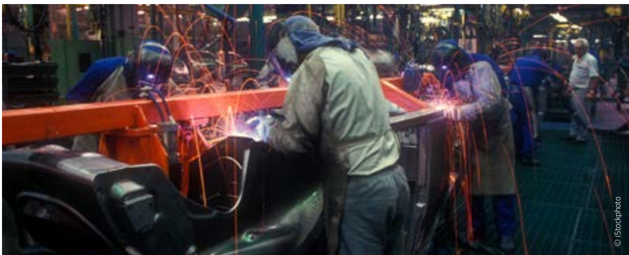
Human capital: the European labour force is a key source of growth.

EU steps up its recommendations to the Member States in the employment, education and social inclusion areas