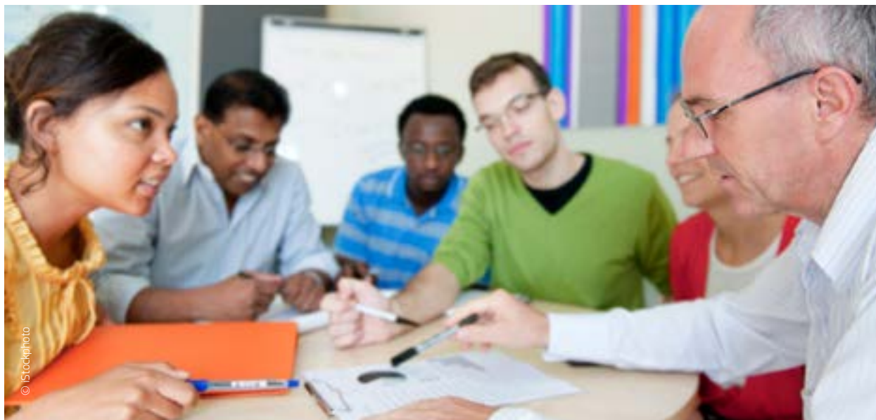
Lifelong learning: "The investment case needs to be made continuously, responding to the continuously evolving needs of people throughout their lifetime".