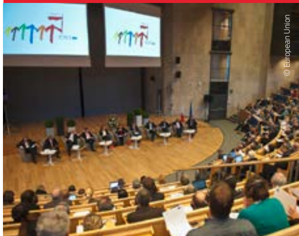
First meeting: the anti-poverty convention met for the first time in Warsaw in 2011.

The Platform's programme also seeks to promote evidence-based social innovation: designing ways of measuring the actual impact of innovative projects in a given context and their potential to be transferred to other parts of the EU, and to deepen policy coordination with the Member States, as well as partnership with civil society.