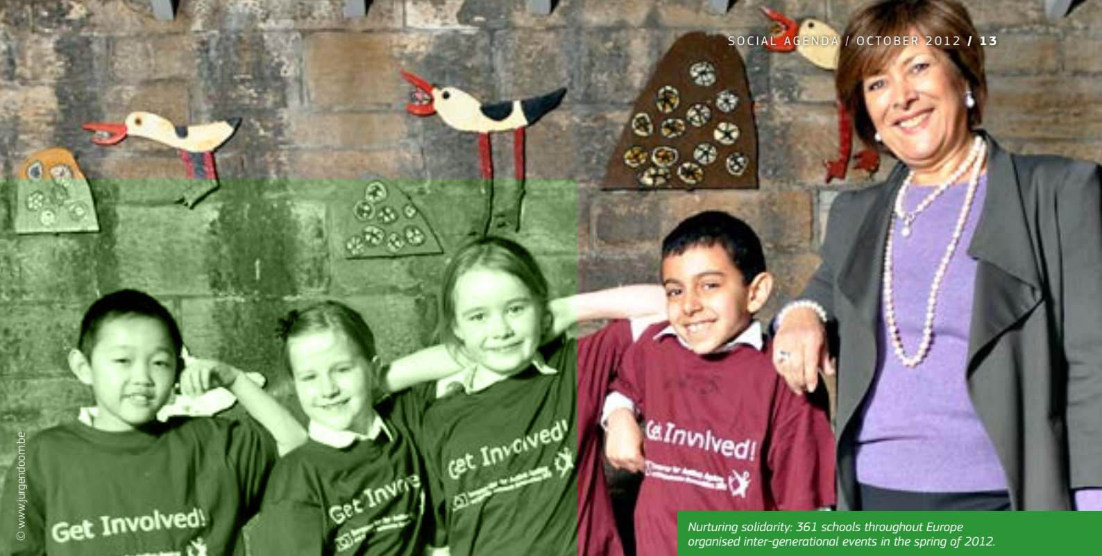
Nurturing solidarity: 361 schools throughout Europe organised inter-generational events in the spring of 2012.

By the time the school children of today will be in charge, there will be fewer active people on the labour market to support retired people, “but this doesn’t need to be a problem. Together, we can make it become an opportunity for all generations (...) There is a strong sense of solidarity between generations in our societies. But with more older people needing the support of a smaller number of young people, this solidarity could weaken, especially if young people are having a difficult life themselves (...) Solidarity between generations