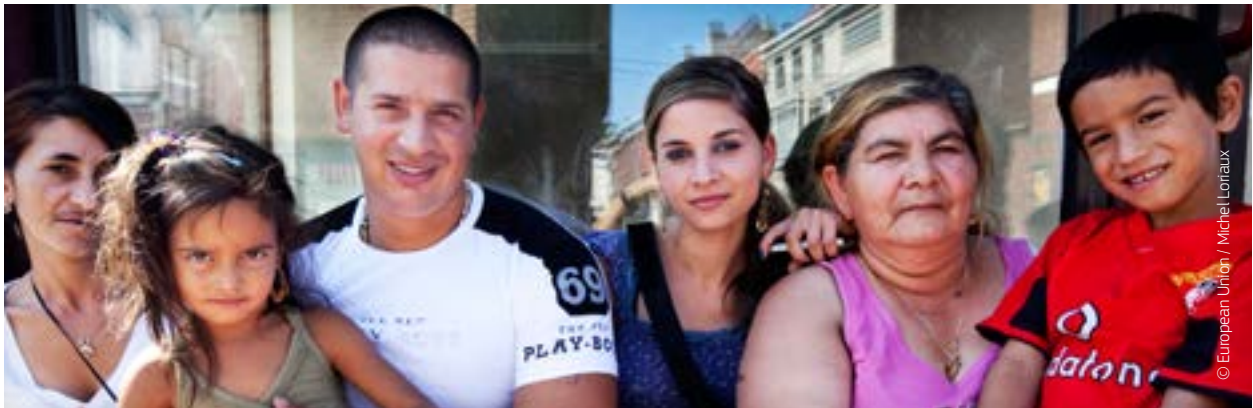
Inclusion: Each EU country has set up a national Roma inclusion strategy within a European framework.

Fighting successfully against poverty requires successfully integrating the EU's largest ethnic minority