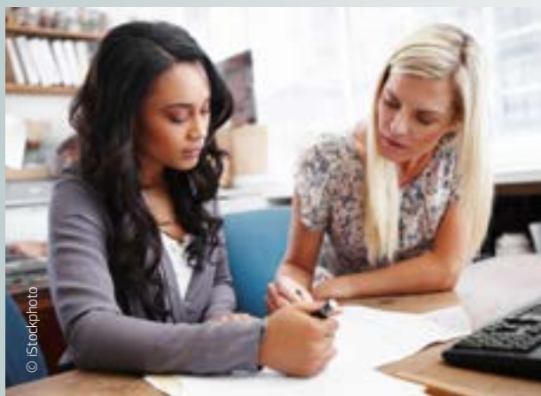
Informal learning: national systems for the validation of non-formal and informal learning should be in place by 2015.

As part of its strategy for creating jobs and growth, the European Commission has launched an initiative to boost the recognition of skills and competences gained outside school or university. The Commission's proposal aims to increase job opportunities in particular for the young unemployed and those with few formal qualifications such as older and low-skilled workers. It also seeks to increase access to higher education, especially among mature students. Through this recommendation, the Commission is urging Member States to establish national systems for the validation of non-formal and informal learning by 2015. This would allow citizens to obtain a full or partial qualification on the basis of skills and competences acquired outside formal education. Only Finland, France, Luxembourg and the Netherlands currently have comprehensive systems in place for validation of non-formal and informal learning.