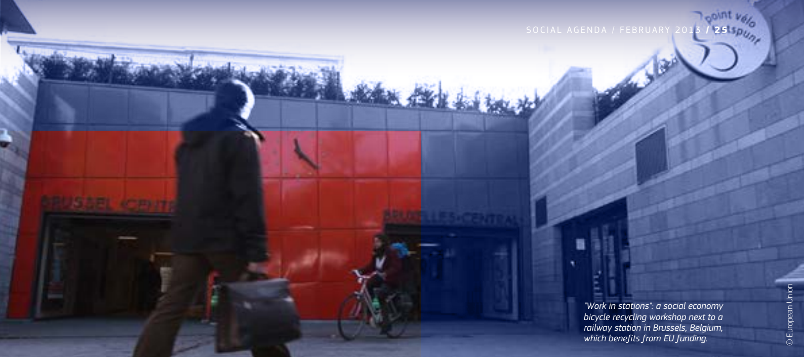
"Work in stations": a social economy bicycle recycling workshop next to a railway station in Brussels, Belgium, which benefits from EU funding.