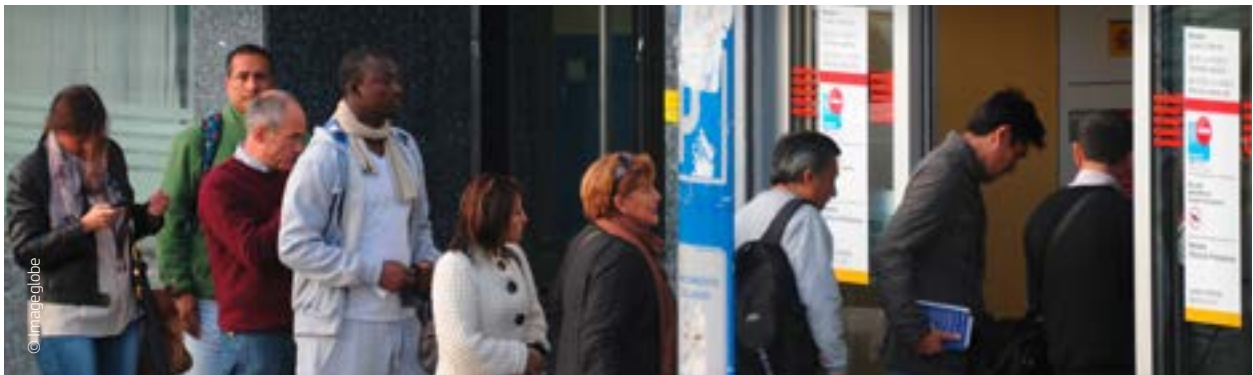
Longer and longer: a marked increase in the number of short-term unemployed who have turned long-term.

New kind of data gives a more vivid perception of the reality behind the statistics