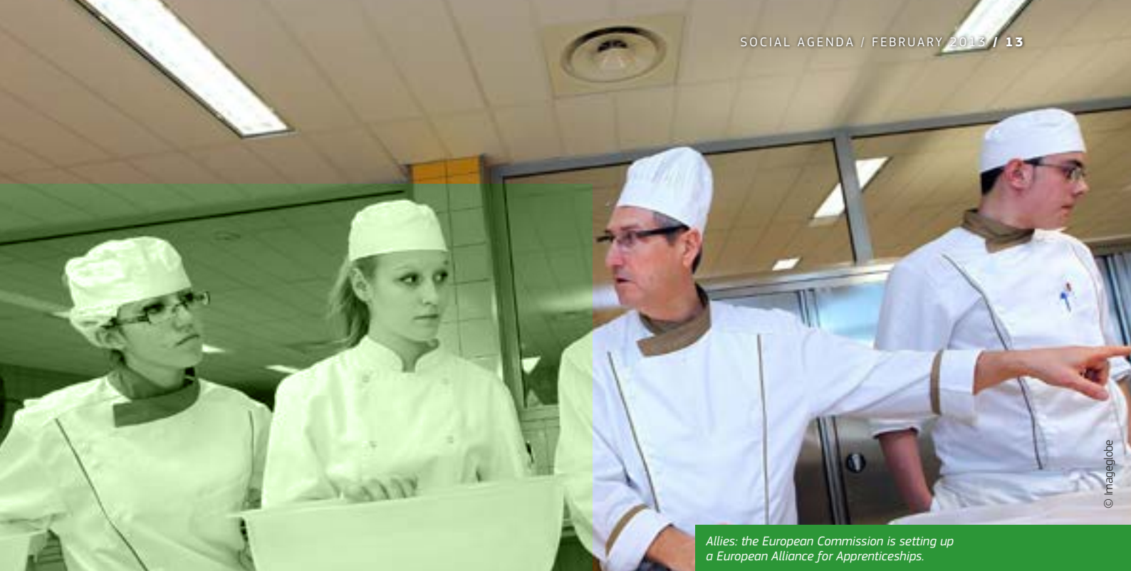
Allies: the European Commission is setting up a European Alliance for Apprenticeships.