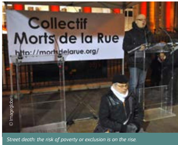
Street death: the risk of poverty or exclusion is on the rise.

After five years of economic crisis and the return of a recession in 2012, unemployment is hitting new peaks not seen for almost twenty years, according to the 2012 edition of the Employment and Social Developments in Europe Review. Household incomes have declined and the risk of poverty or exclusion is on the rise, especially in Member States in Southern and Eastern Europe. The impact of the crisis on the social situation has now become more acute, as the initial protective effects of lower tax receipts and higher levels of spending on social benefits (“automatic stabilisers”) have weakened. A new divide is emerging between countries that seem trapped in a downward spiral of falling output, fast rising unemployment and eroding disposable incomes and those that have so far shown good, or at least some, resilience. The latter tend to have better-functioning labour markets and more robust welfare systems (see special feature p.14 onwards).