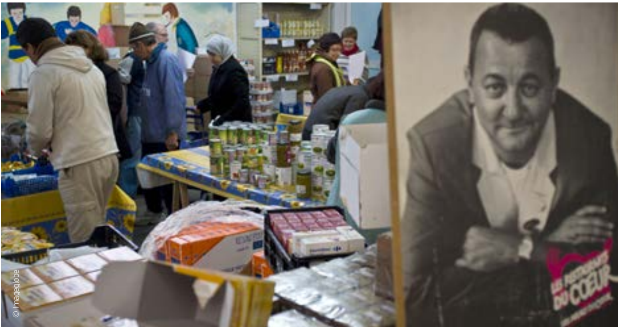
Coluche: the founder of the Restos du Coeur, Michel Colucci, was behind the creation of the first EU fund for the deprived.

A decision on creating a new fund was in the hands of EU ministers and of the European Parliament at the time of printing