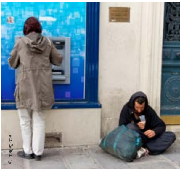
Keeping up with current expenses: A "financial distress" indicator now identifies the share of people who have to draw on their savings.

Similarly, the Commission is using simulation models to estimate the present-day poverty rate. It combines data on poverty, which takes two years to collect, with the labour market developments and changes in the policy rules that have occurred in the meantime.