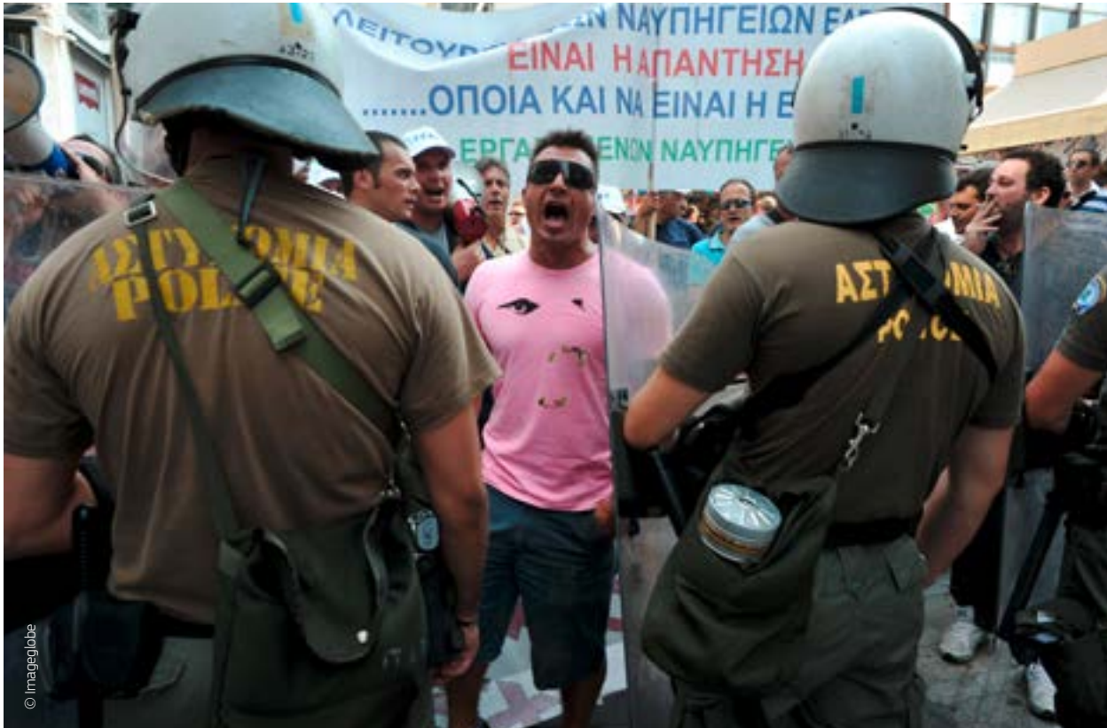
Close to breaking point: The austerity measures adopted by governments make it urgent to address the issue of social expenditure as a productive investment.

this rather complex three-pronged approach to poverty and social exclusion, where we look at poverty in relation to a national median income, material deprivation (the crucial indispensable items that people are not able to afford) and the percentage of people living in jobless households, i.e. the labour market aspect. This fairly complex structure, which has been adopted by the Member States, is still quite hotly debated in academic circles.