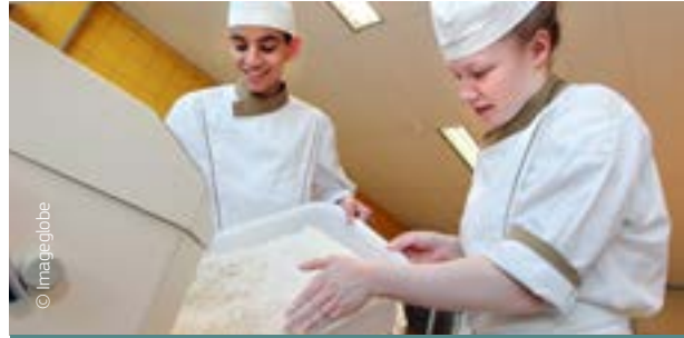
Large differences: the proportion of low-wage earners differ greatly between men and women.

The proportion of low-wage earners among employees amounted to 17.0% in 2010 in the EU. This proportion varied significantly between Member States, with the highest percentages observed in Latvia (27.8%), Lithuania (27.2%), Romania (25.6%), Poland (24.2%) and Estonia (23.8%), and the lowest in Sweden (2.5%), Finland (5.9%), France (6.1%), Belgium (6.4%) and Denmark (7.7%). Low-wage earners are defined as those employees earning two thirds or less of the national median gross hourly earnings. Hence, the thresholds that determine low-wage earners are relative and specific to each Member State. There are large differences between men and women, levels of education and types of contract.