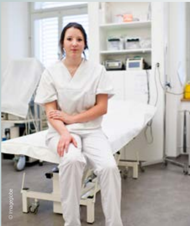
In good health: the demand for health professionals continues to grow.

The European Commission has published two reports to analyse skills needs in Europe: the European Vacancy Monitor and the European Job Mobility Bulletin. The latest Vacancy Monitor shows that although most of the main occupations experienced a decline in recruitment in the first quarter (Q1) of 2012 compared to Q1 2011 (crafts and related trades -12%, operators and assemblers -7%, elementary occupations -13%), two high-skilled groups of occupations continued to grow: professionals (+5%) and technicians and associate professionals (+2%) which are employed in a broad range of sectors such as business, finance and health. The December issue of the European Job Mobility Bulletin analyses the vacancies published on the EURES portal. It shows that good job opportunities are available for finance and sales associate professionals (87 000 vacancies), shop salespersons and demonstrators (66 700 vacancies), housekeeping and restaurant services workers (40 500 vacancies), personal care and related workers (40 300 vacancies) and modern health associate professionals except nursing (39 000 vacancies). In order to better assess what skills are the most needed, which can help policy-makers in the design of education curricula but also young people in choosing their education and jobseekers in making better informed career choices, the Commission recently introduced the EU Skills Panorama.