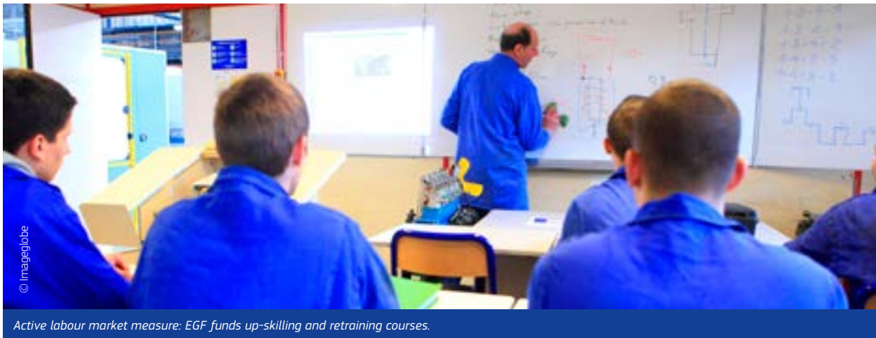
Active labour market measure: EGF funds up-skilling and retraining courses.

EU co-financing paid out to Member States rose by 54.1 % compared to 2010